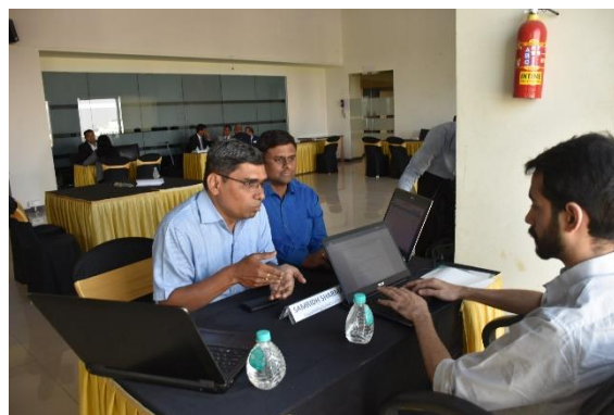
Equanimity Investment interacting with Start-ups