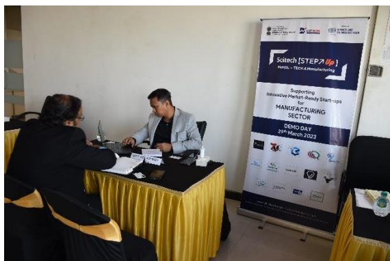
Mumbai Angels interacting with Start-up