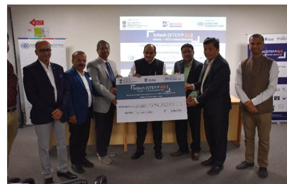
2 nd Runner-Up WaveNxD Technologies Pvt Ltd

The Demo Day also provided the start-ups to pitch to the investors, facilitators, HNI/Angels, Banks etc. to raise funding for their companies as the event observed a bumper response from the investors. 14 investors from Pune, Mumbai and Bangaluru participated in this event. Some of the known institutional investors present were Indian Angel Network & IAN Fund, SeaFund, Mumbai Angels, Sigma Ventures, Windrose Capital, Equanimity Investments, Pentathlon Ventures, IDFC First Bank etc. Interestingly, many who could travel to Pune have requested e-introductions and showed interacting with start-ups online in coming days.