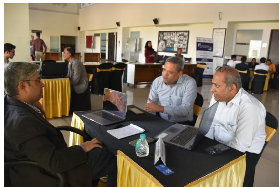
Seafund interacting with Start-up