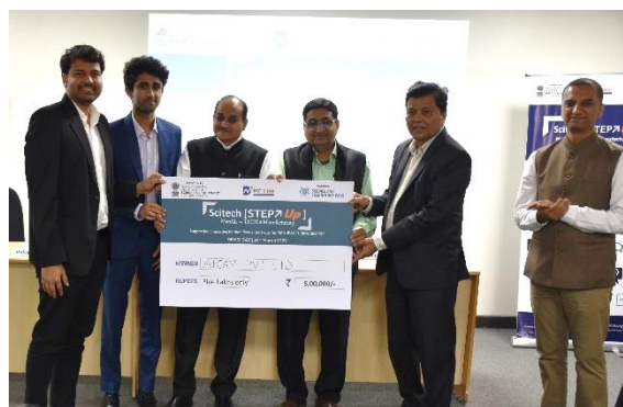
Winner AICAN Pvt Ltd