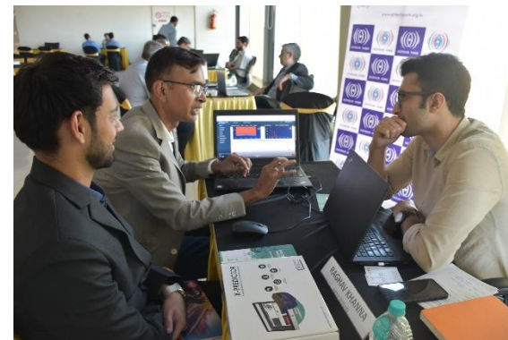
Sigma Ventures interacting with Start-up