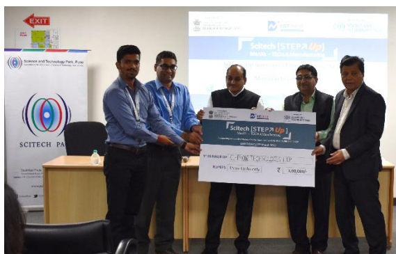
1 st Runner-Up C-Probe Technologies LLP